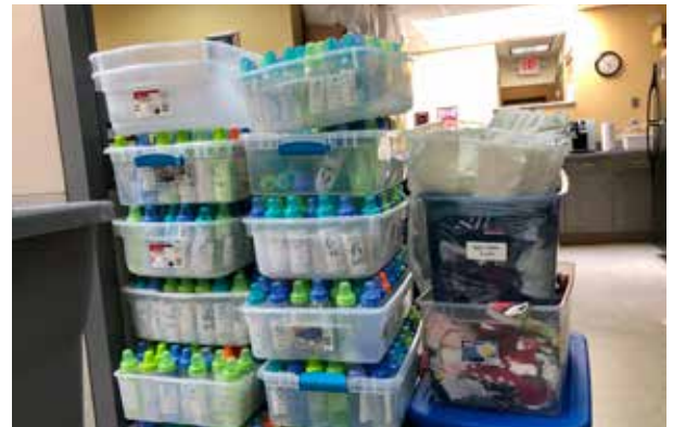
Current material assistance room

It's been ten years since we last moved. The design of our current building poses obstacles that we must struggle to overcome every day to serve the needs of our clients, who have more than doubled in just the past four years. There is a lack of privacy with a cramped,