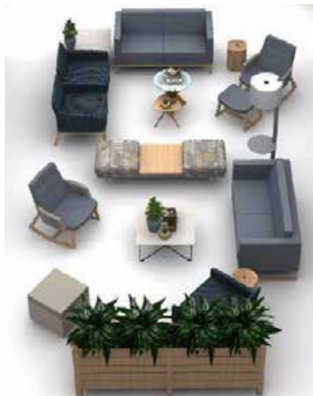
Comfortable new lobby

These gifts have put us within financial reach of what we need for renovations, increased client capacity, and service line expansion.